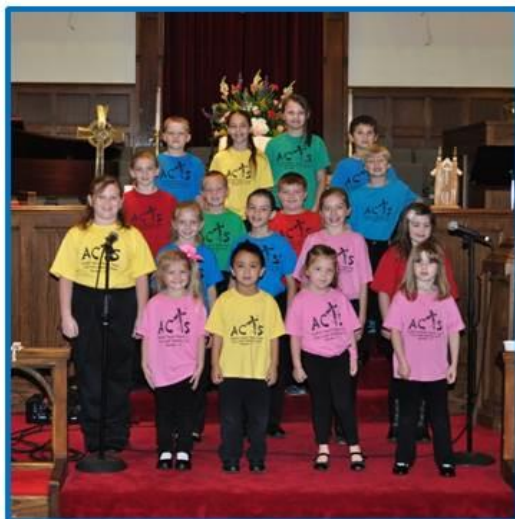
Singing in Worship